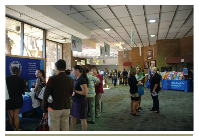
Learning and sharing ideas during the Chapter Professional Development Workshop at SDCE Educational Cultural Complex on October 4th, 2014

First and foremost, teachers must ensure that classrooms are safe, welcoming, and inclusive spaces for all students regardless of sex, race, gender, sexual orientation, and cultural background. Specifically, students should feel that they can respectfully share their thoughts, ideas, beliefs, and opinions without fear of being censored or judged negatively by their teachers.